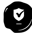
BOILER TANK LIFETIME WARRANTY