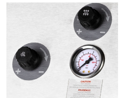
STEAM AND DEGREASER VOLUME CONTROL