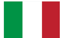
MADE IN ITALY