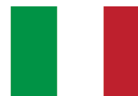
MADE IN ITALY