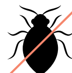
KILLS BED BUGS