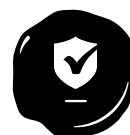
BOILER TANK LIFETIME WARRANTY