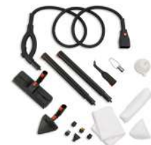
15-PIECE ACCESSORY KIT