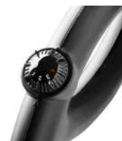
ADJUSTABLE STEAM AND HOT WATER SWITCH