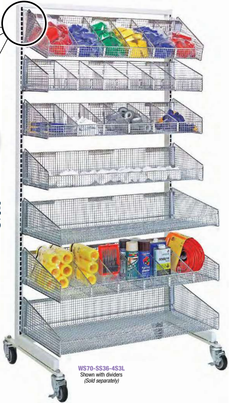
WS70-SS36-4S3L Shown with dividers (Sold separately)