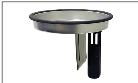
Wet pickup adapter with reliable float shut-off (B260089)