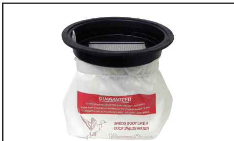
Complete HEPA Filter Assembly consisting of air seal gasket, polyester prefilter, spacer sleeve and Dacron filter bag (B526520)